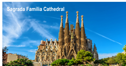
Sagrada Familia Cathedral