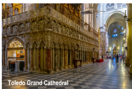
Toledo Grand Cathedral

Hotel : Silken Puerta Madrid or similar (B/D)