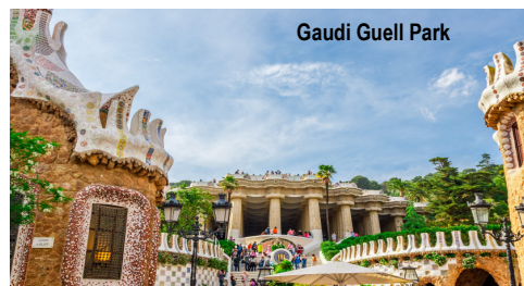
Gaudi Guell Park