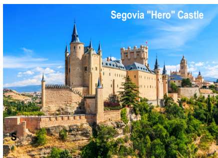
Segovia "Hero" Castle