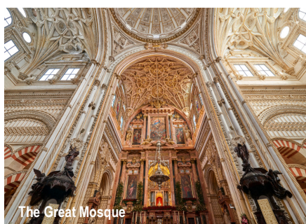
The Great Mosque

Tour Leader, Driver & 7 Local guides Gratuity Total (Euro) €130 per person